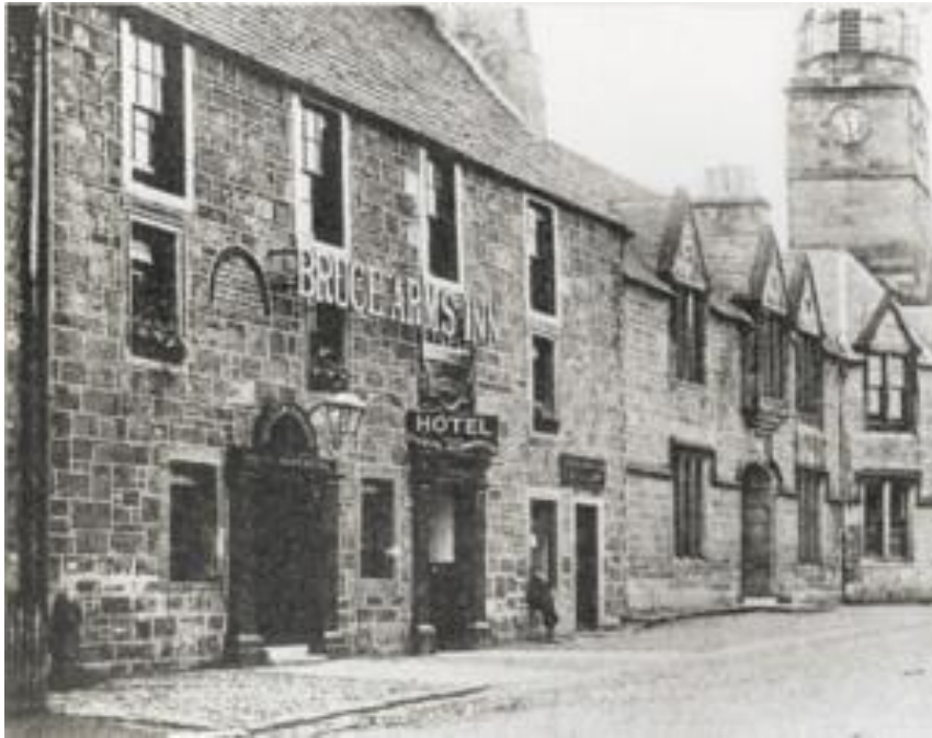
Bruce Arms (date unknown)