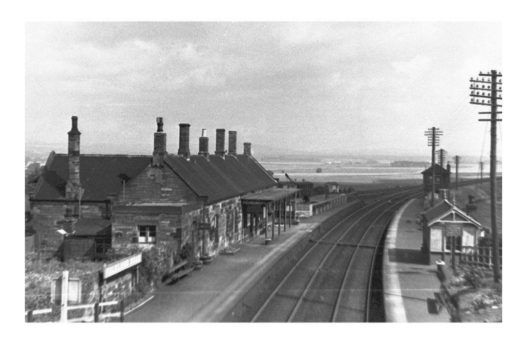
Falkland Road Railway Station