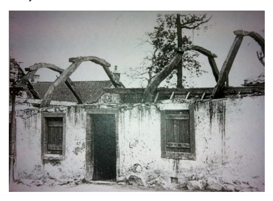
Oldest House in the Burgh of Falkland (High Street)

day when the hewers felled it in the adjoining forests of Falkland, and these interesting relics have wisely been preserved in one of the rooms of the old Palace. Until a few years ago, these "roof –trees" had sheltered Falkland Post Office as far back as the oldest inhabitant could remember. The house immediately adjoins the existing remains of the gate pillars of the "East Port" of Falkland, and it is not an unreasonable conjecture that it was at one time the abode of the keeper of that gate. The late Marquess of Bute, to whom the house belonged, evinced the keenest interest in the old building. Recently, however, it gave unmistakeable signs of decay, and its demolition became a regrettable necessity in the interests of public safety."