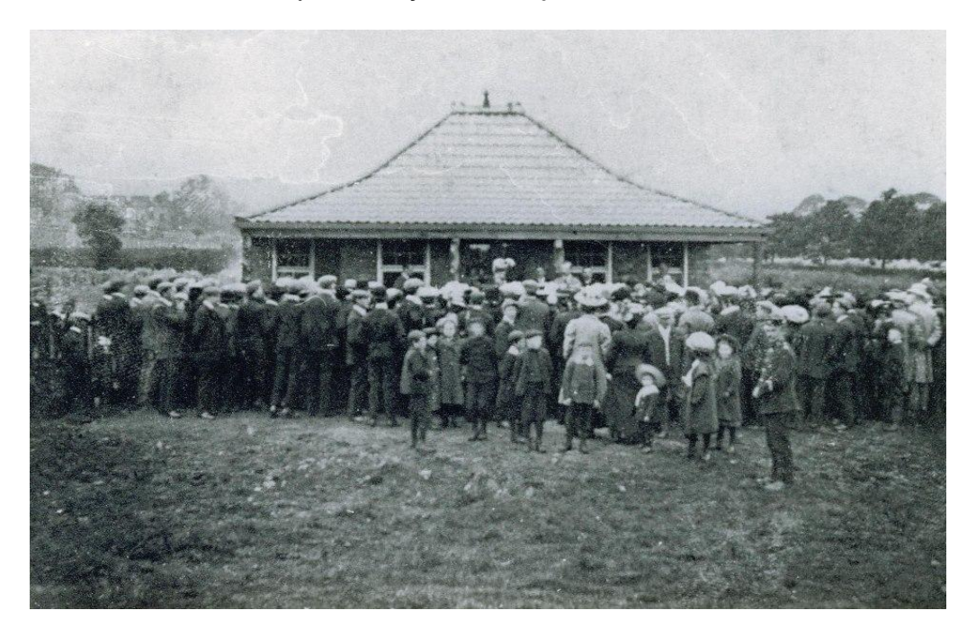
Falkland Golf Club Clubhouse Opening