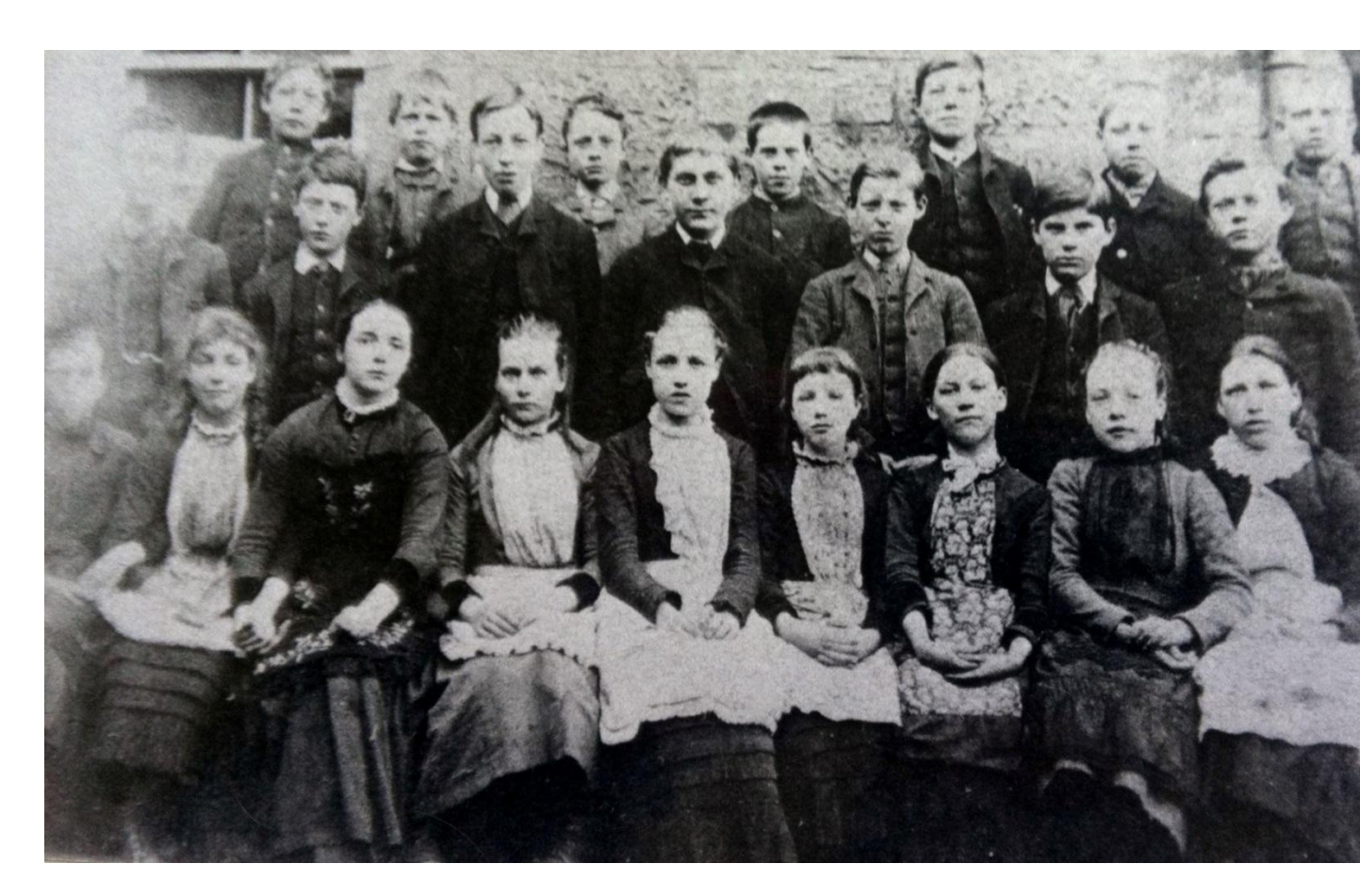
Falkland School Group c1910