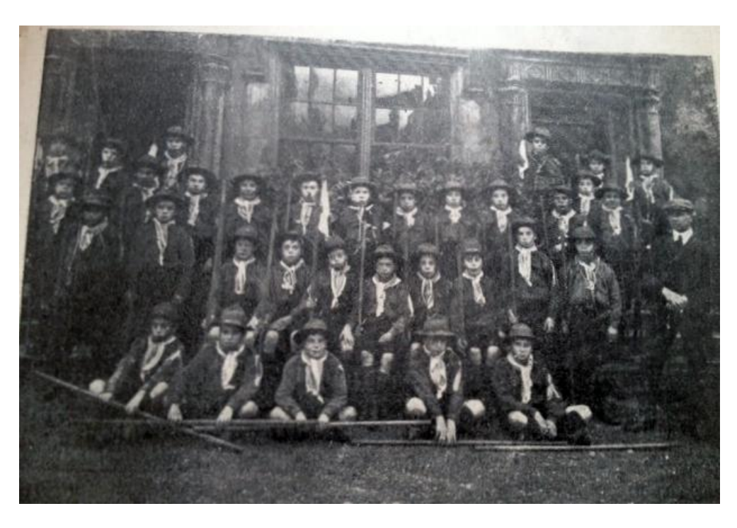
Boy Scouts from Falkland, Auchtermuchty, Strathmiglo and Newburgh.

Extract from The Fife News Almanac: Historical Tableux at House of Falkland – "Lady Ninian Crichton-Stuart at House of Falkland organised three public entertainments during the Christmas and New Year holidays (1910-1911), in aid of the Falkland Girls' Club. The following photograph shows some of the tableaux: -