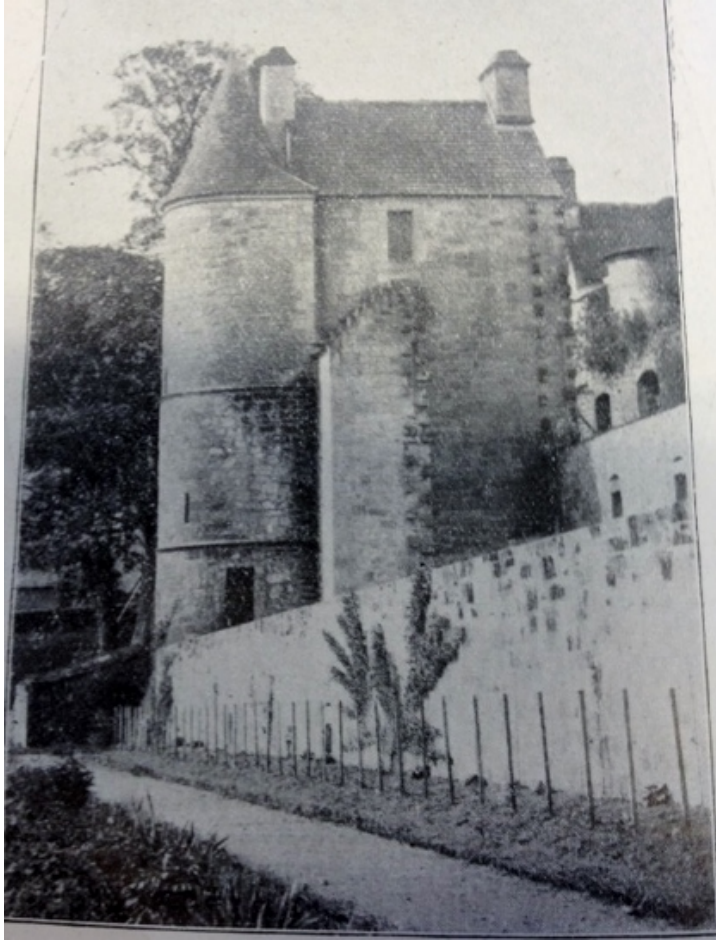
The Tower at Falkland Palace.

“This is where the heir apparent to the Crown, the young Duke of Rothesay, was cruelly starved to death.”