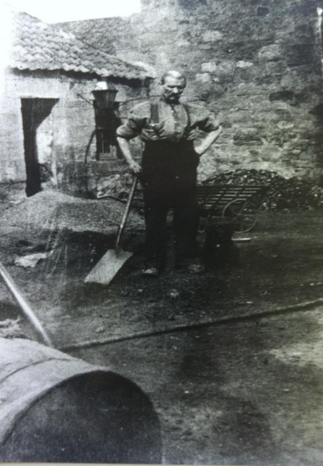
Gas Works in the distance (chimney) at the Gas Works