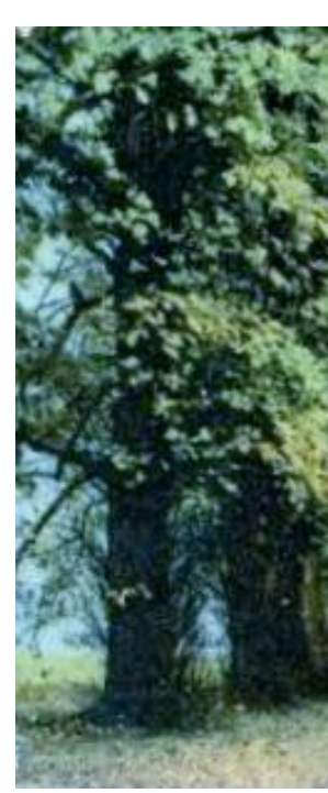
Falkland House Staff c1900 The Avenue, Falkland House c1907