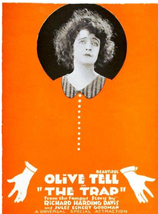
Advert for 'The Trap'(1919)

Extract from The Fife News : Cinema – "The cinema was well attended this week. On Monday the drama was 'Broken Ties', and tonight (Friday) 'The Trap' will be screened."