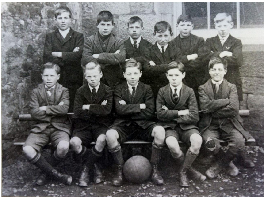
Falkland School Football Team 1921