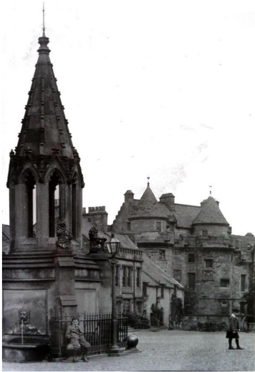
The Fountain circa 1921