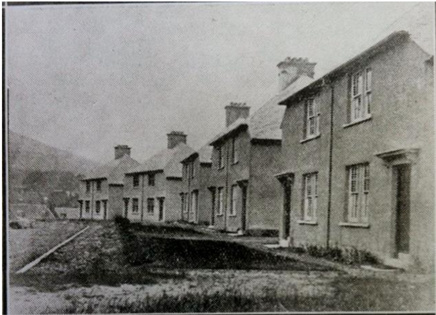
Lomond Crescent circa 1921

Extract from The Fife News : Housing – “A good start has been made with the housing scheme, the first lot of houses being in the process of erection.”