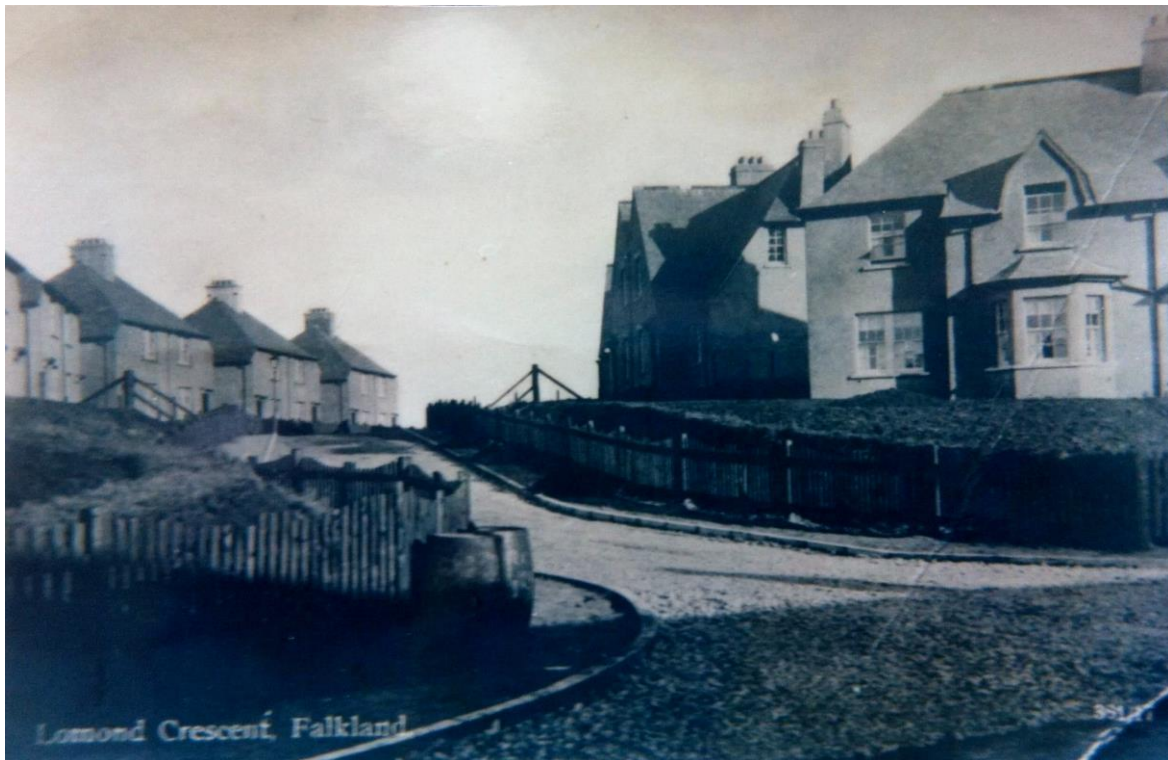
Lomond Crescent (circa 1921)

convenient houses. The outsides are very becoming, and the houses are in a splendid position. It is a pity the Government should not have seen their way to spend the money in improving the old properties in the town.”