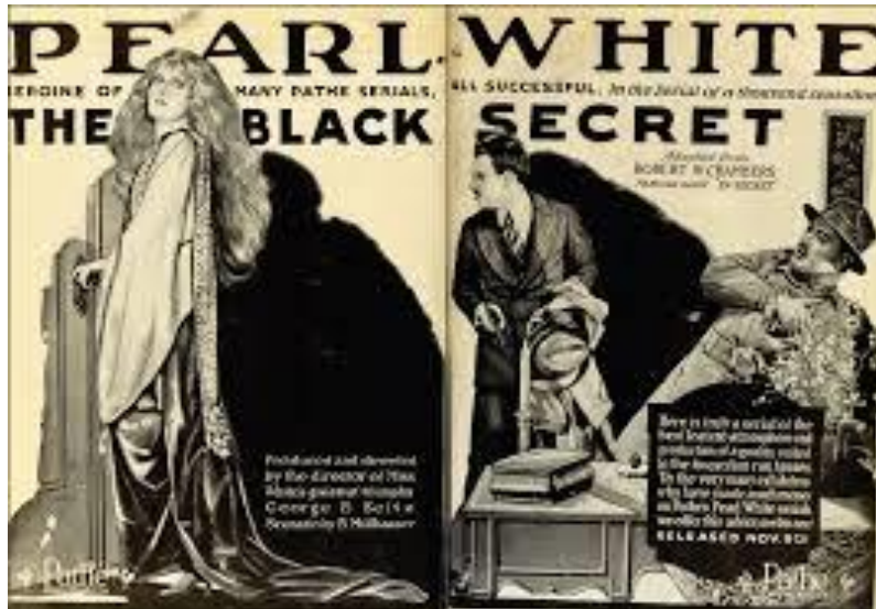
Advert for the film 'The Black Secret' (1919), starring Pearl White.