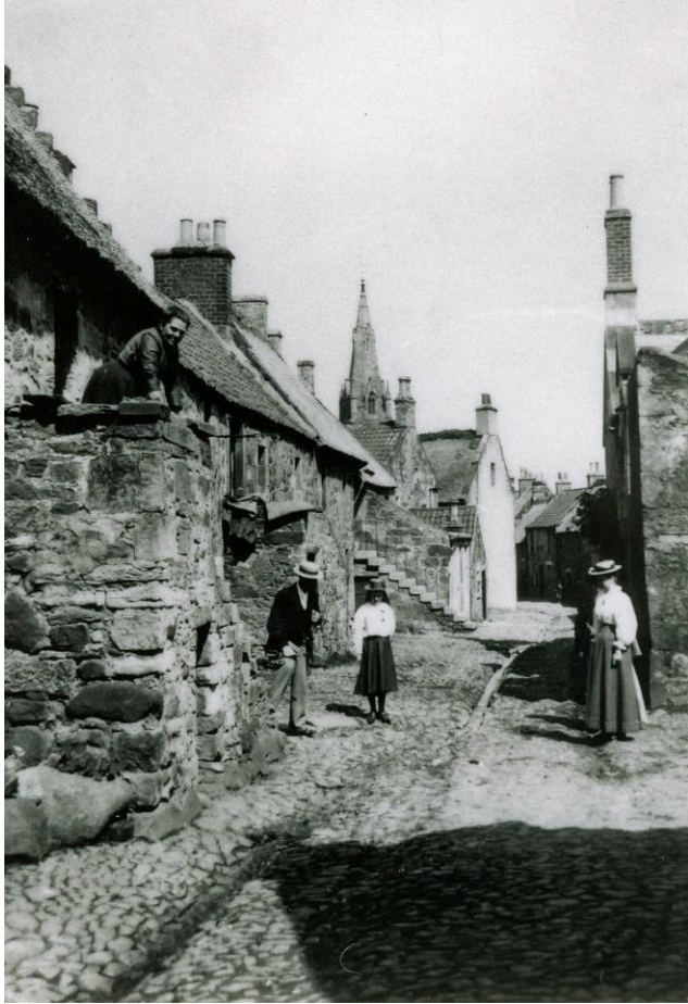
Top of Cross Wynd