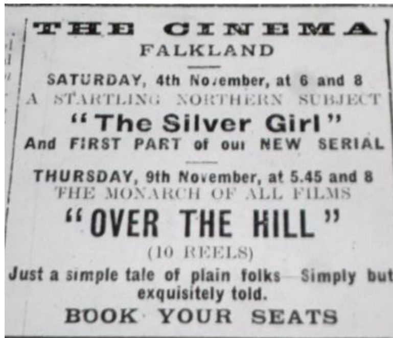
Cinema advert in The Fife News

Extract from The Fife News : Winter – “On Wednesday morning quite a change in the weather was felt in the district. Both the East and West Lomonds were covered with snow. A stoppage of potato lifting was experienced by the farmers owing to weather conditions.”