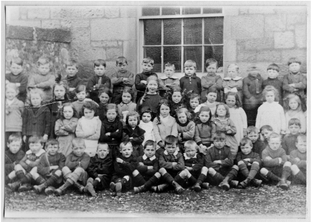
Falkland School 1922