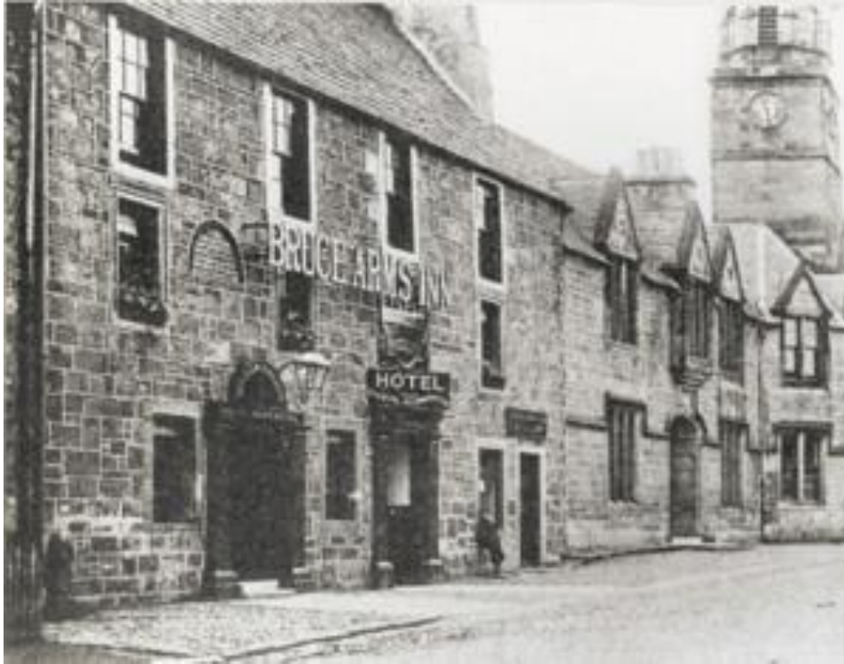
Bruce Arms Hotel, Falkland