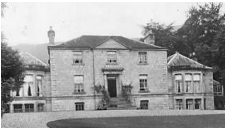
House of Millfield, Falkland.

Advert in The Fife News : Falkland, Fifeshire – For Sale: