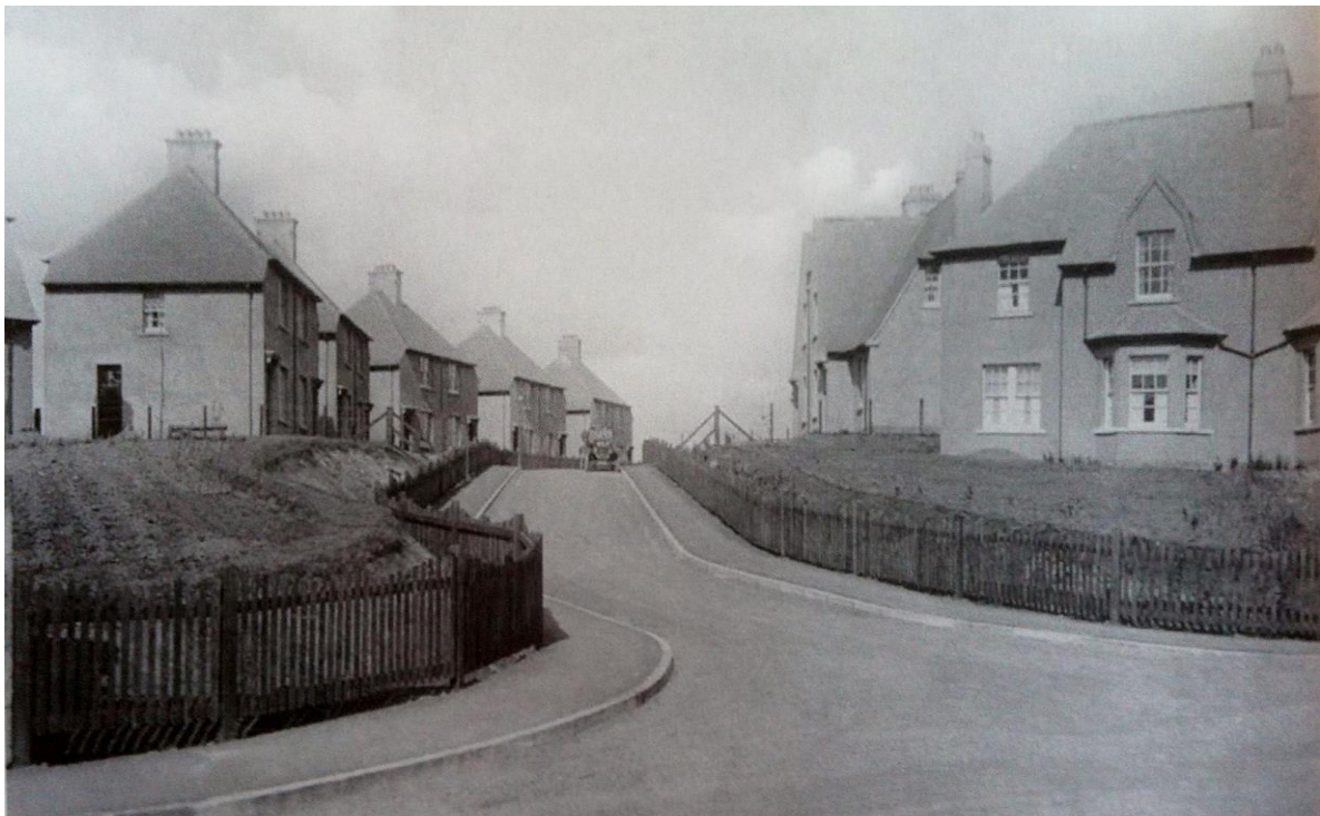
Lomond Crescent (circa 1922)

Extract from The Fife News : New Housing Scheme – “This week the first four of the new houses erected under the housing scheme have been let by the Town Council, and the tenants are now moving in. There has been no official opening. Anyone who has seen the houses states that they are quite up-to-date, with all modern improvements.”