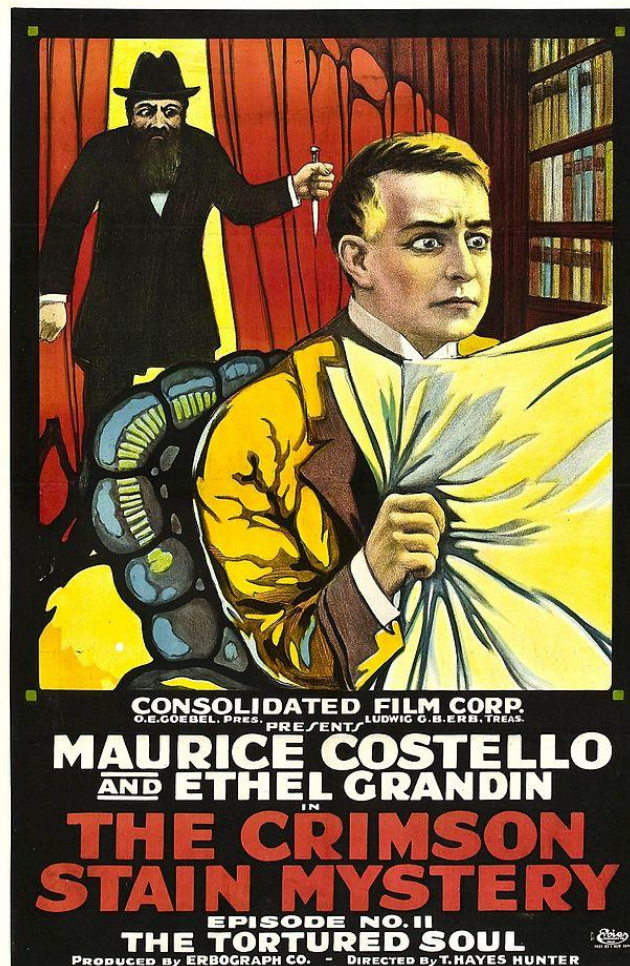
The Crimson Stain Mystery

Extract from The Fife News : Cinema – “A splendid turnout witnessed the excellent drama ‘The Silver Girl’ on Saturday evening. The first episode of the ‘Crimson Stain’, a serial that is sure to draw, was also shown.”