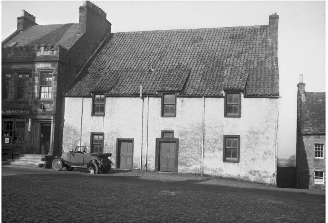
St Andrews House, Falkland

Extract from The Fife News : Holiday – “The Spring holiday was observed on Monday. The public works, schools, and shops were closed for the day. The burgh was very quiet, and the weather was against visitors.”