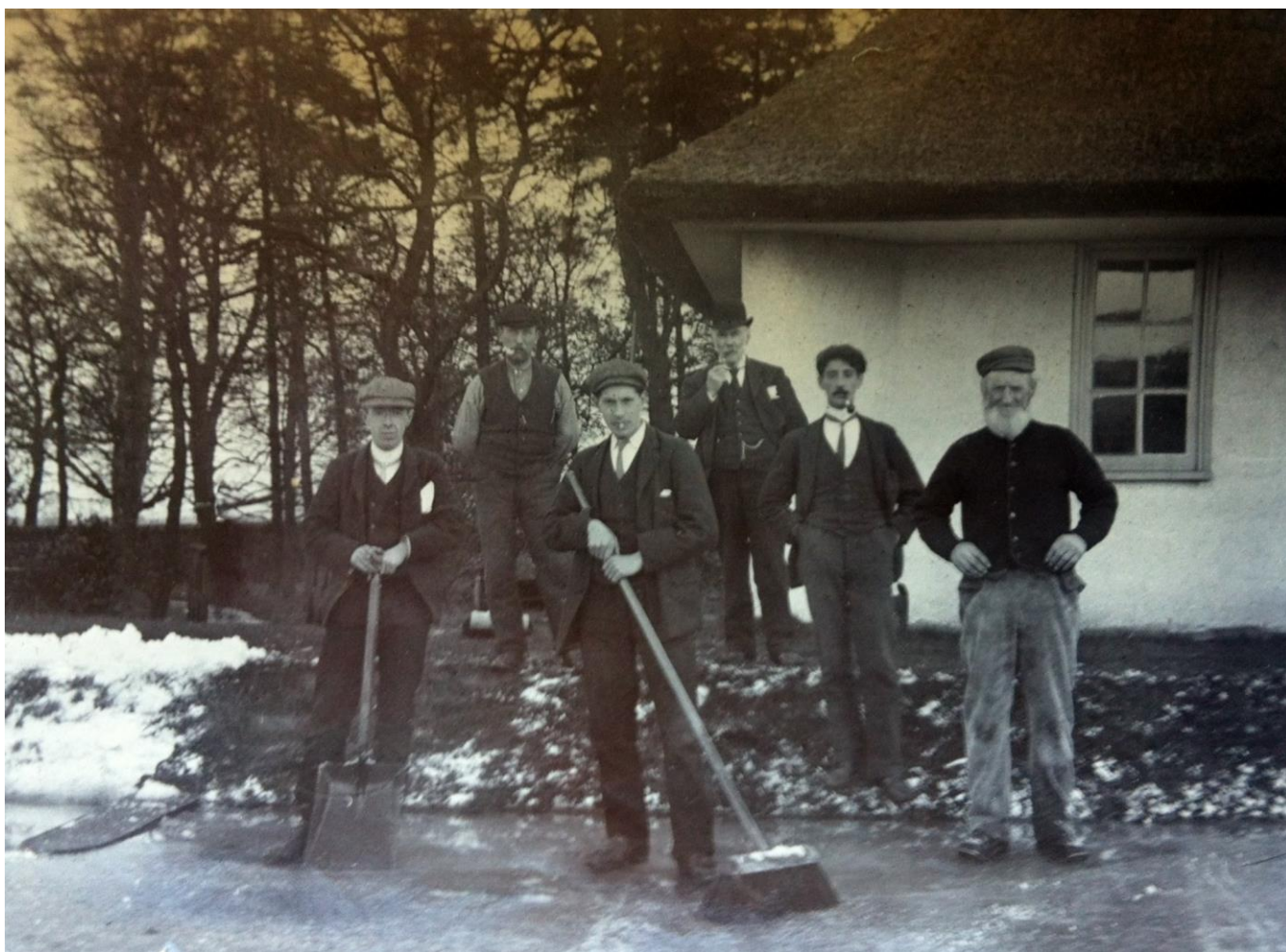
Falkland Curlers circa 1920's

Extract from The Fife News : Town Council – “The monthly meeting of the Town Council was held in the Council Chambers on Wednesday evening. The rents of the 4 and 5-roomed new houses were fixed at £18 and £21, respectively. The contracts were fixed for the fencing of the houses. An application from the postmen to have a holiday on Saturday was read. It was agreed to delay till next meeting in order to get fuller particulars as to what is being done in other places. The Council agreed to let the Drill Hall for pictures on Saturday evenings to the former tenant.”