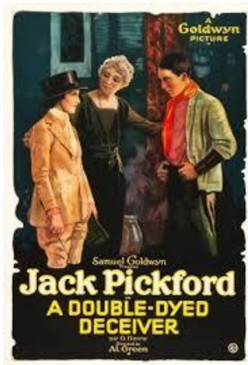
'A Double-Dyed Deceiver' (1920)