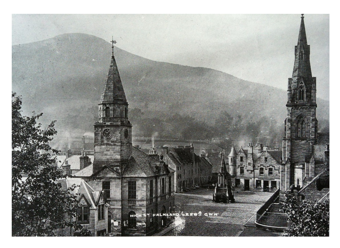
Falkland Square from the Palace (circa early 1900's)

One is struck at once by the similarity of design to part of Holyrood, and the resemblance is not accidental. Both were designed at the same time by Sir James Hamilton of Finnart, a natural son of the Earl of Arran.