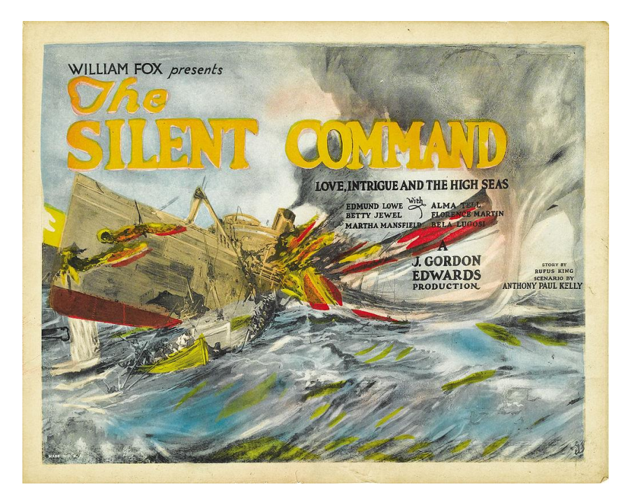
The Silent Command (1923)

Extract from The Fife News: Cinema – "The Drill Hall was packed on Saturday night, when 'The Silent Command' was shown. Serial topical interest, and comedy films completed a first-class programme."