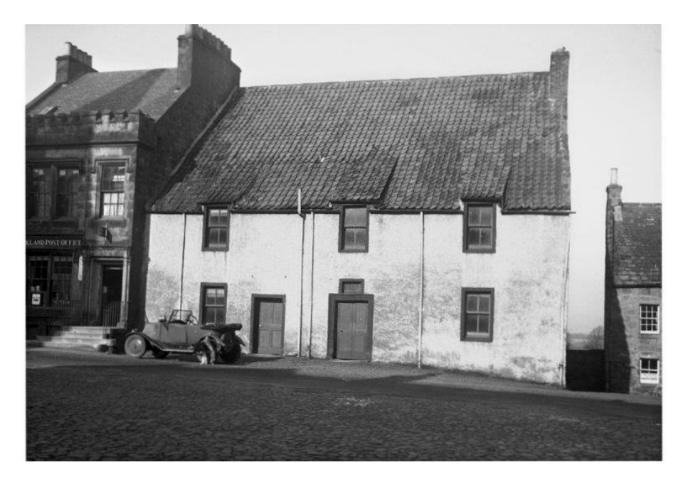
St Andrews House, Falkland

Extract from The Fife News: School – "The Public School re-opened on Monday morning after three weeks' potato holidays."