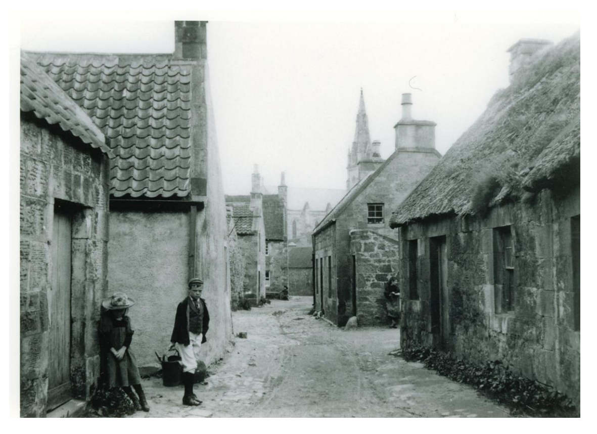
Balmblae (circa 1920's)