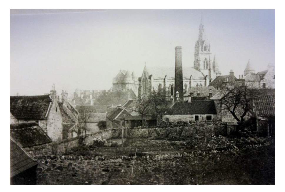
Balmblae (circa 1920's)

Extract from The Fife News: Football – "Freuchie Rovers did not find the Lomond Vale the 'easy meat' they expected when the pair clashed at Freuchie on Saturday afternoon. In fact, the burgh team had as much, if not more, of the play than their opponents, partly due, no doubt, to the encouragement they received from the large contingent of Falkland supporters. To hold Freuchie to a draw of three goals each was good work on the part of the Vale, and no doubt neighbouring Clubs will be sitting up and taking notice."