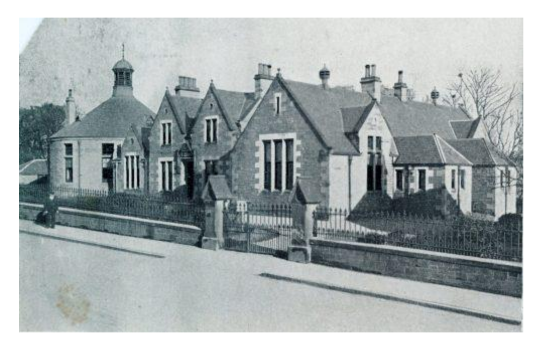
Kirkcaldy Cottage Hospital (opened 1890)