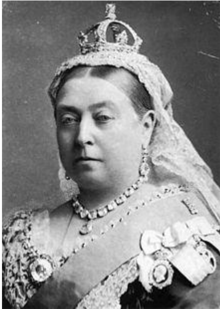
Queen Victoria (1819-1901)

Extract from The Fife News Almanac : Death of Queen Victoria.