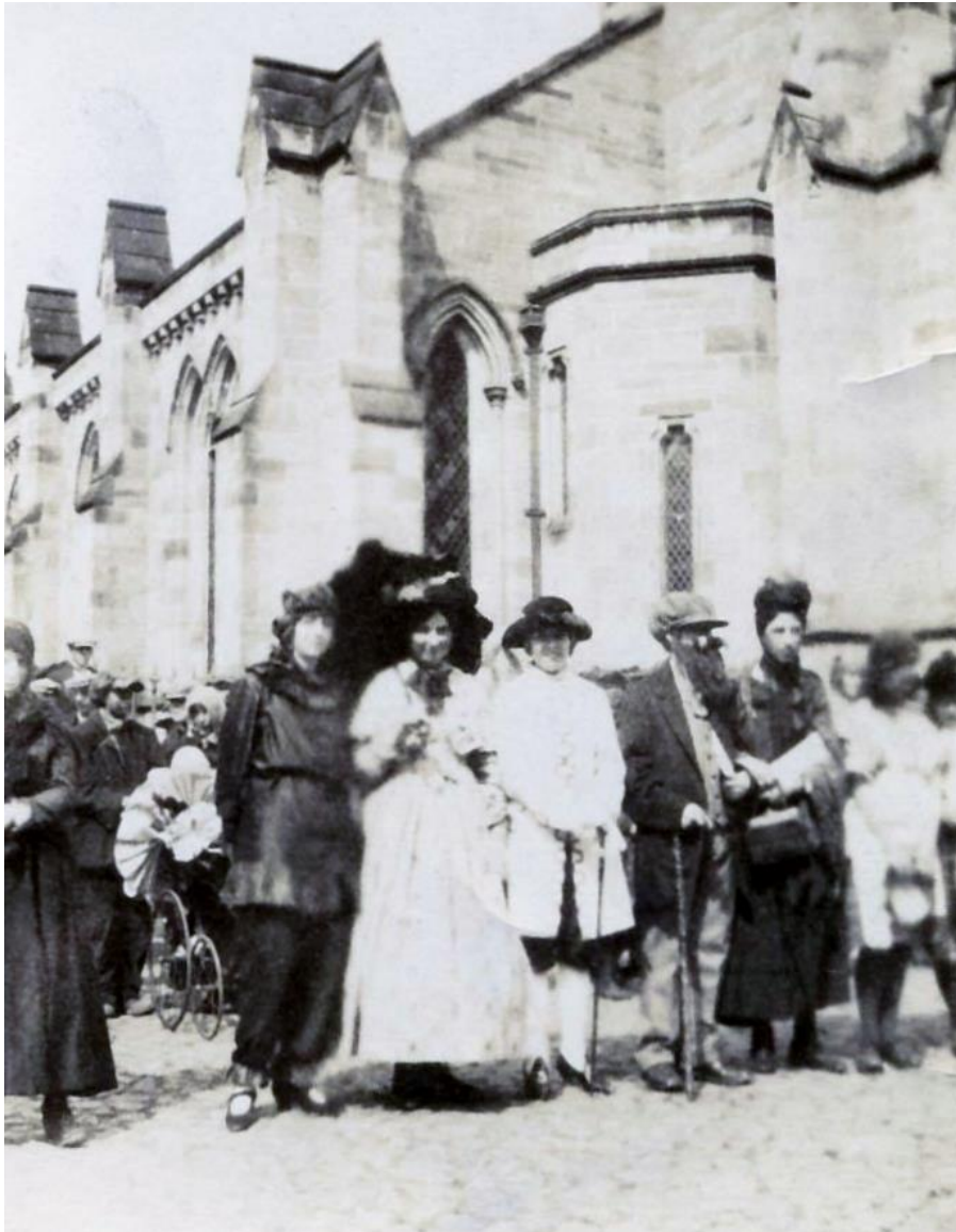
Possibly Peace Celebrations Fancy Dress

Much praise is due to the Committee who successfully carried through the arrangements. A great disappointment was felt in the village at the absence of a bonfire on the East Lomond.”